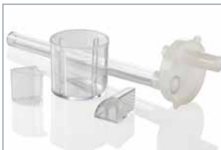
ECONOTRAP™ Polyp Trap Two Chamber Polyp Trap