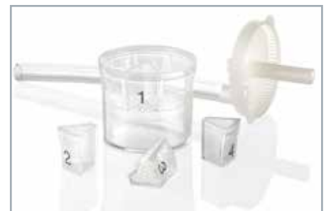
THE ADVANTAGE POLYP TRAP™ Collection Container (Four Chamber)