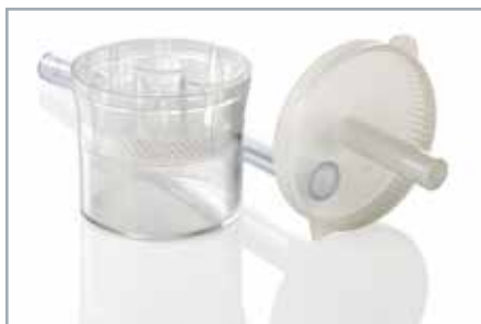
ECONOTRAP™ Polyp Trap Single Chamber Polyp Trap