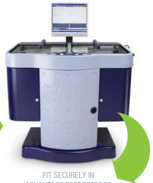
FIT SECURELY IN ADVANTAGE REPROCESSOR